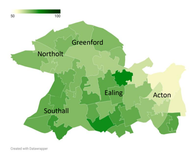
Figure 1: Percentage of MSOA residents in Ealing borough who had received at least one dose of a COVID-19 vaccine as of 14 February, 2022. Map made by the study team

Youth vaccine eligibility & permissions. Youth vaccination began in August 2021, when young people ages 16-17 became eligible to receive COVID-19 vaccines, followed by youth ages 12-15 in September. While adults can receive Moderna, Oxford/AstraZeneca, or Pfizer-BioNTech, only the Pfizer vaccine is available for those under 18. As of February 2022, only people aged 16 and up were eligible for a booster dose. Parental consent is sought for COVID-19 vaccination for youth under the age of 16.10,11 However, children can consent for themselves if they are deemed competent following an evaluation by a medical professional trained in the 'Gillick competence' framework. 10 Despite the now widespread availability of vaccines to youth, COVID-19 itself was widely portrayed as a disease affecting the elderly and those with preexisting conditions. This, alongside the fact that